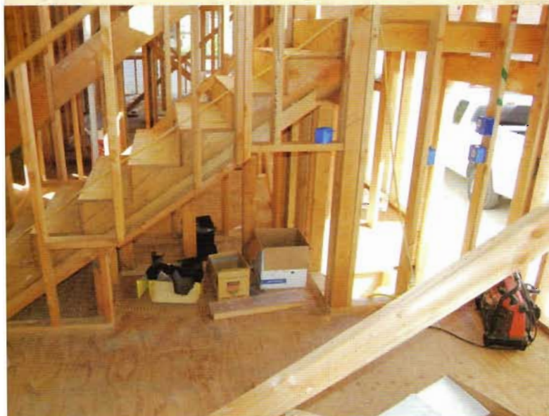
Borate pressure treatments have proven to be cost effective as well as effective against termites; shown here is a recent Graham Builders home.

Use of borates also is increasing in the development of engineered wood products. "Many of those products are now being made available to Hawaii that are treated at the production process," says Person. "Because they are made of fiber, this provides a treatment that is dispersed throughout the wood product. More of that is being made available to Hawaii where they use zinc borate — as opposed to sodium borate treatments in