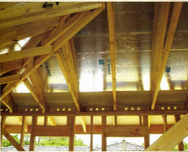
Proper construction and quality building materials are key to the durability of a wood-framed home, according to Graham Builders.

Built on a three-acre parcel, Mike Fujimoto says, "It's going to be a full assortment of lumber and building materials as well as our Custom Metal Roofing product line. We've had the roofing line on Oahu for almost 14 years, in Kalihi. With the new, much larger facility, we are consolidating our metal roofing along with our new entry into lumber and building materials on Oahu.")