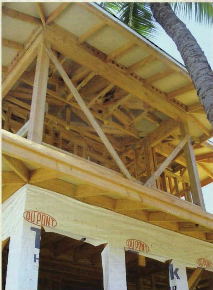
A custom-built home in Kailua, a project for Graham Builders, which is a proponent of wood framing