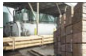
Lumber pressure-treated locally with Hi-bor® to preserve wood and protect against termites.

Eighty-five years of continuous reinvestment in facilities, technology and expertise, providing you with a dependable source of the basic building blocks for development on the Big Island and statewide. Call us for a tour of our operations and demonstration of our capabilities.