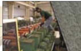
Metal roofing and panning manufactured in 12 profiles & 14 standard colors for endless design options.