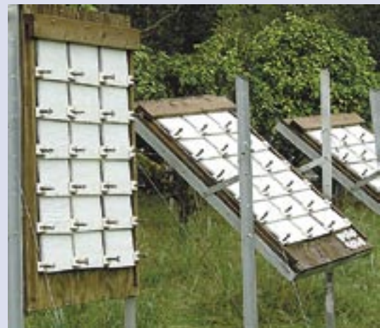
LP SmartSide siding placed on 45 and 90-degree walls in Hilo, Hawaii, for accelerated performance testing.

percent faster than fiber cement-based siding. The siding also is manufactured in extra long, 16-foot boards, which