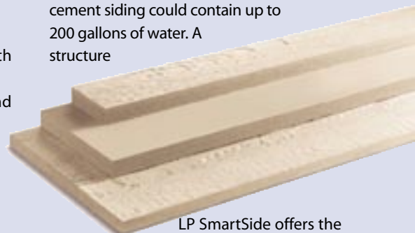
LP SmartSide offers the traditional look of wood siding without the maintenance commonly associated with wood siding.

True to its superiority in moisture resistance, recent testing by LP also has shown that fiber cement-based siding absorbed 168 percent more water than LP SmartSide over a 21-day exposure period. A structure with 2,000 square feet of fiber cement siding could contain up to 200 gallons of water. A structure