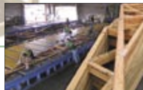
Truss structures designed and constructed in the largest & most technically advanced truss manufacturing facility in the State.