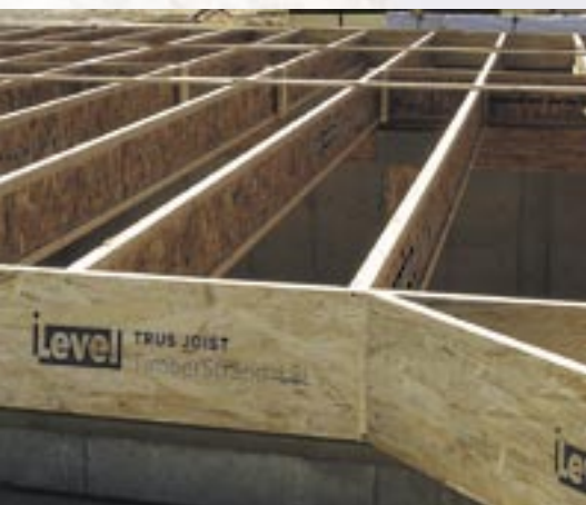
iLevel TimberStrand being used as rim board

engineered lumber because of the perception that it was difficult to use. Engineered wood can be worked using common tools, including standard saws and hammers. Past challenges such as difficulty in driving nails have been addressed through refinements in material composition and manufacturing.