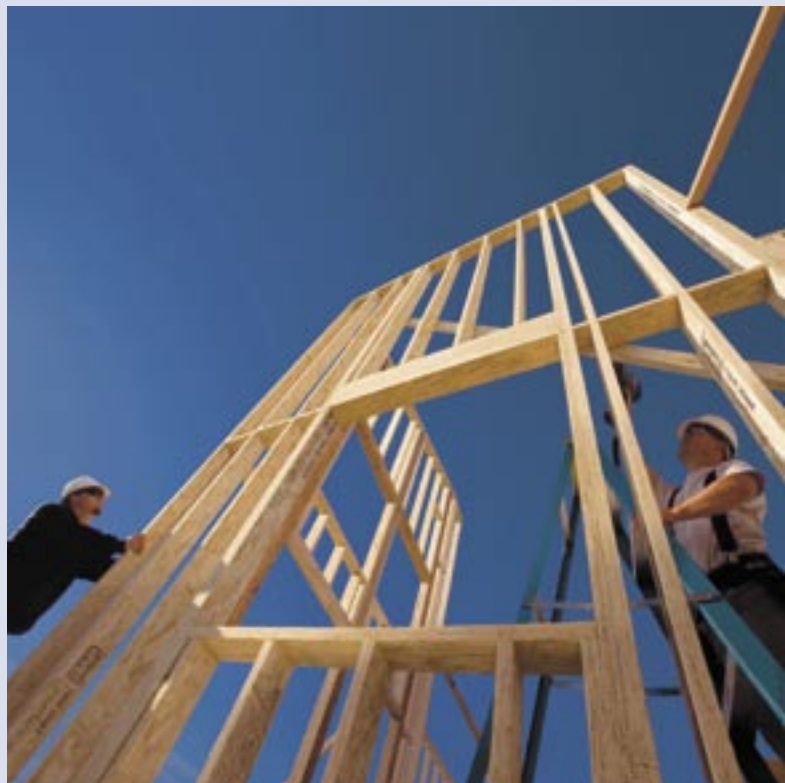
iLevel TimberStrand LSL

Homebuilding has come a long way in the past centuries. Despite the availability of alternate materials, wood is still the most popular choice for most residential structural framing, used in about 85 percent of new homes by some estimates. Builders trust wood, and now engineered wood products are helping them build homes even better — offering the strength, consistency and performance needed for more precise framing.